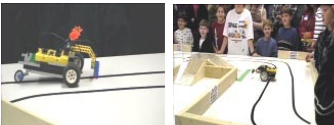
Figure 4. Images from the competition among the teams of Weston Middle School students. Left: A Robot follows the black electrical tape reliably around the course. Right: Parents and siblings watch as the bumper-robot navigates the course by bumping into the wooden walls.

Too often in schools these days there is one right answer to a question. When students have the notion that there is one right answer, it can often scare them into not even trying to think about it. If they give their version of the answer, it might be wrong, and they will immediately be labeled as