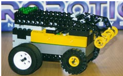
Figure 2. Simple robot with a front bumper used at the first lesson.

The second lesson started with another modify-challenge, using the robots from the first meeting. Students were able to modify robot programs and show that they understand their meaning. Later, they assembled a complete robot according to a given detailed instruction from the original LEGO documentation (another source can be used instead, the number of available material on the Internet is growing quickly). In this lesson, students got involved in the intricacies of robot assembly.