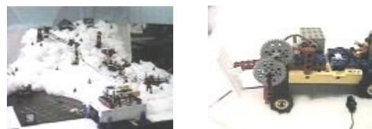
Figure 3. The LEGO Ski Resort - the systems engineering project at the first two-week workshop to use the RCX and ROBOLAB. The resort, left and close-up of snow plow, right.

The Center for Engineering Educational Outreach (CEEO) at Tufts University (located near Boston) provides numerous opportunities for teachers, student-teachers, and students to learn about engineering. One of the largest programs, LDAPS (LEGO Data Acquisition and Prototyping System), is aimed at creating new software tools, curriculum units, and workshops for students and teachers. The latest software from the CEEO is ROBOLAB. Known as the Mindstorms for Schools™ , ROBOLAB is a programming environment that uses a graphical flowchart style of programming that utilizes more features of the LEGO RCX than the Mindstorms retail set. The highlight of the teacher workshops is the culmination project. Teachers are introduced to the concept of systems engineering - where groups of "experts" in structural engineering and programming collaborate together to plan, construct, program, and present a complex engineering system.